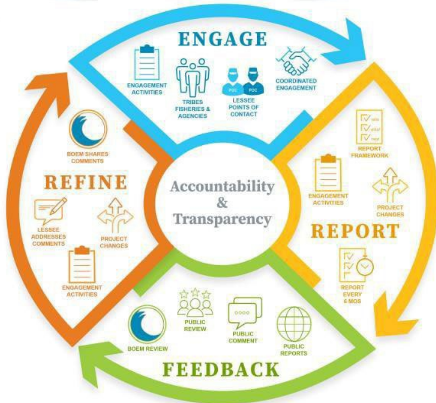
BOEM Stakeholder Communication Approach

The Bluepoint Wind FCP has been developed based on BOEM guidelines and best management practices (BMPs) guidance from other relevant resources (Attachment A). The objective is to define outreach and engagement strategies for fisheries interests that may be affected during the planning, construction, operation, and eventual decommissioning of the Project. These strategies will be enhanced with inputs received from the fishing community and updated as the Project progresses.