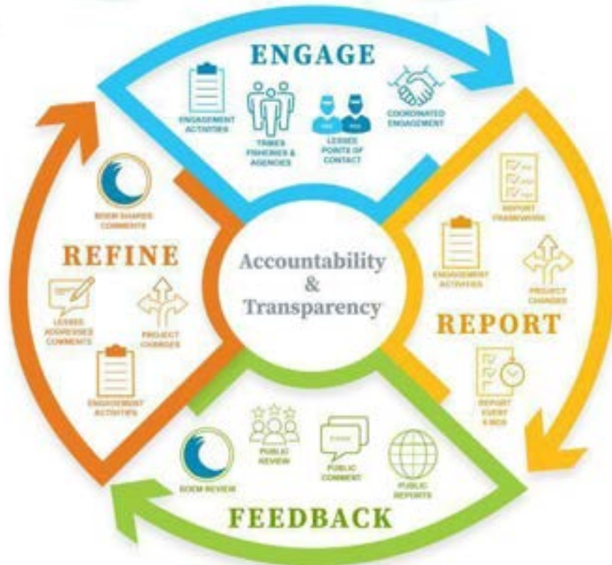
BOEM Stakeholder Communication Approach

The Bluepoint Wind FCP has been developed based on BOEM guidelines and best management practices (BMPs) guidance from other relevant resources (Attachment A). The objective is to define outreach and engagement strategies for fisheries interests that may be affected during the planning, construction, operation, and eventual decommissioning of the Project. These strategies will be enhanced with inputs received from the fishing community and updated as the Project progresses.