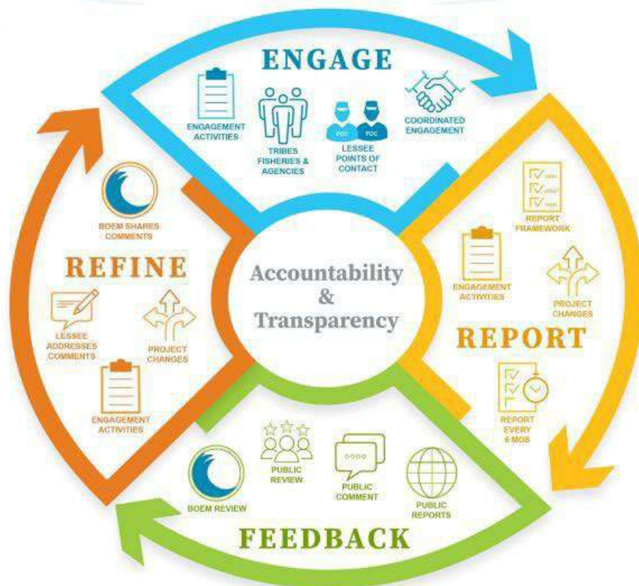
BOEM Stakeholder Communication Approach

The Bluepoint Wind FCP has been developed based on BOEM guidelines and best management practices (BMPs) guidance from other relevant resources (Attachment A). The objective is to define outreach and engagement strategies for fisheries interests that may be affected during the planning, construction, operation, and eventual decommissioning of the Project. These strategies will be enhanced with inputs received from the fishing community and updated as the Project progresses.