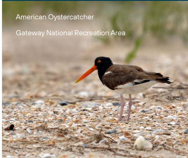
Gateway National Recreation Area