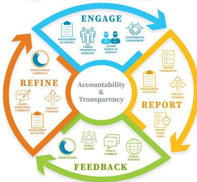
BOEM Stakeholder Communication Approach

The Bluepoint Wind FCP has been developed based on BOEM guidelines and best management practices (BMPs) guidance from other relevant resources (See Appendix A ). The objective is to define outreach and engagement strategies for fisheries interests that may be affected during the planning, construction, operation, and eventual decommissioning of the Project. These strategies will be enhanced with inputs received from the fishing community and updated as the Project progresses.